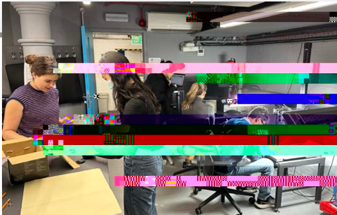
Digitisation class practices