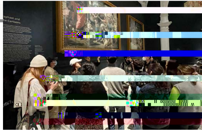
Digitisation students at the V&A