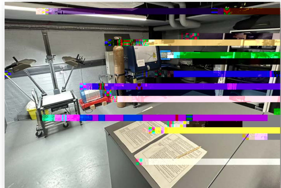
The UCL Digitisation Suite