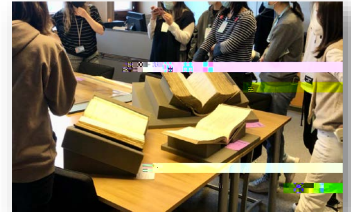
Digitisation students at the British Library